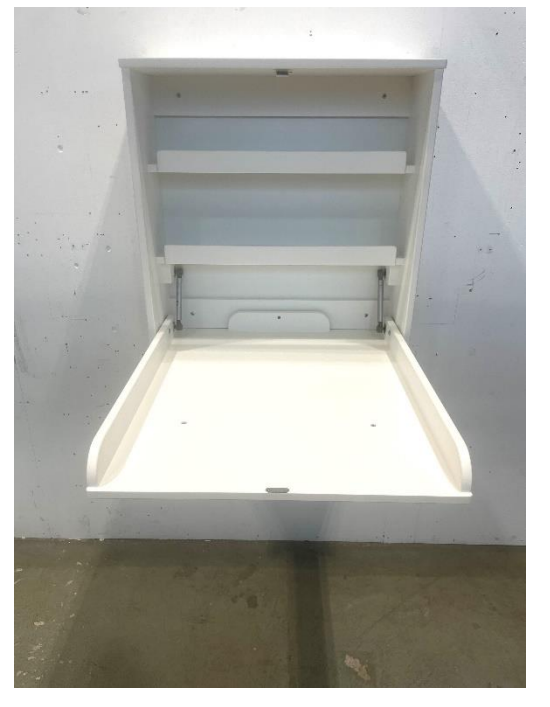
Figure 3 Figure 4